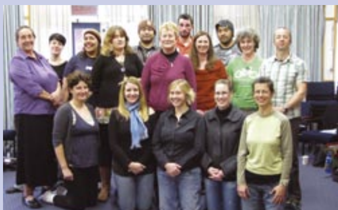
New Zealand Sex & Ethics Training – June 2009

is achieving outcomes in this area. NSW Rape Crisis Centre is proud to be part of this ground breaking endeavour.